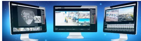
LENSEC - Perspective VMS®

Walkersville, MD (January 11, 2018) – Galaxy Control Systems , a leading manufacturer of access control solutions, announces a new integration between its access control products, Cloud Concierge and System Galaxy software, and the Perspective VMS® from LENSEC , a leader in IP video surveillance solutions. The integration will be officially launched at Intersec 2018, January 21-23, 2018 in Dubai, where Galaxy will exhibit at booth S1-C20.